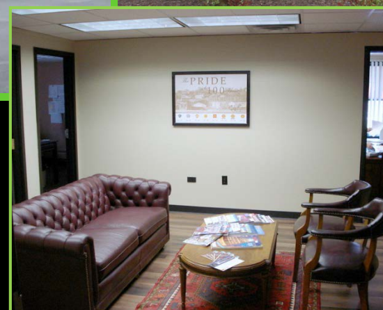
2,000 SF - Office Lobby