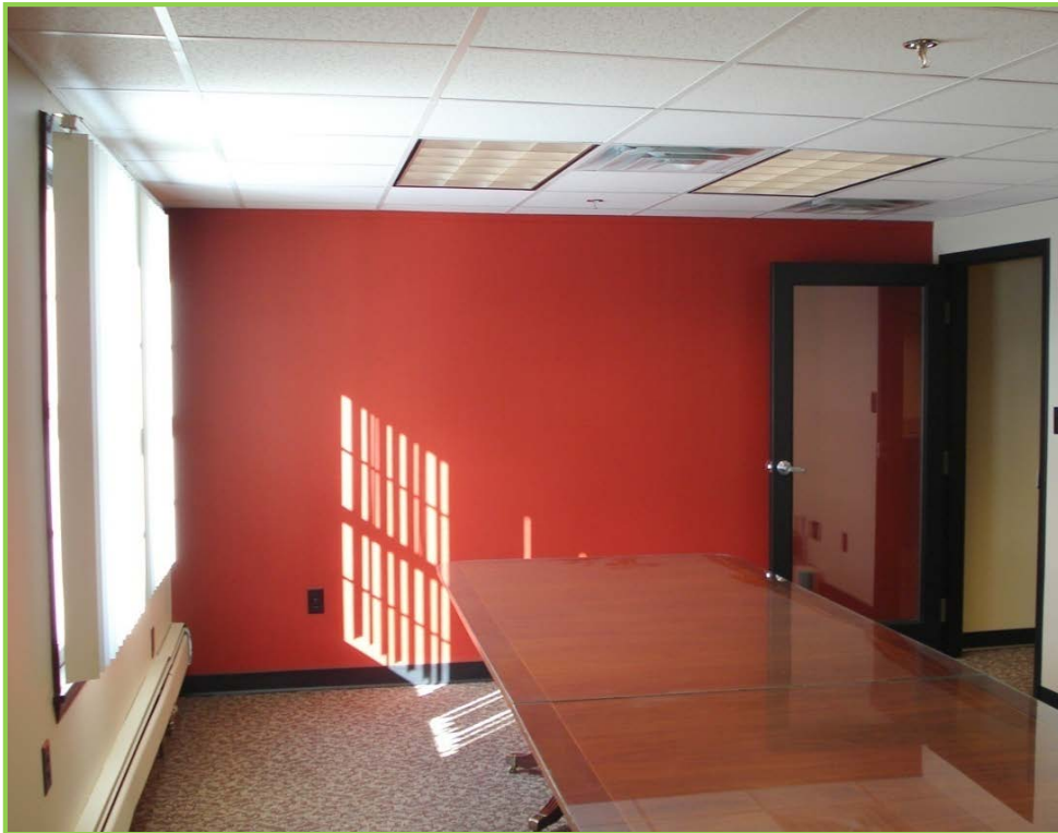
Common Conference Room