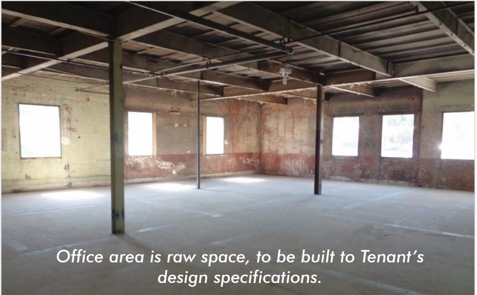
Office area is raw space, to be built to Tenant's design specifications.