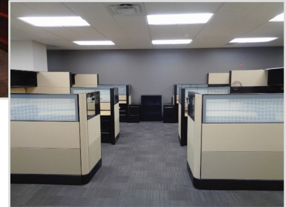
J. Barry Center