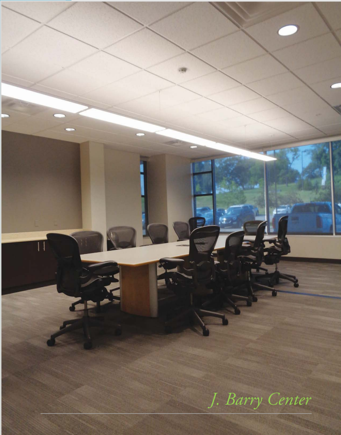
J. Barry Center